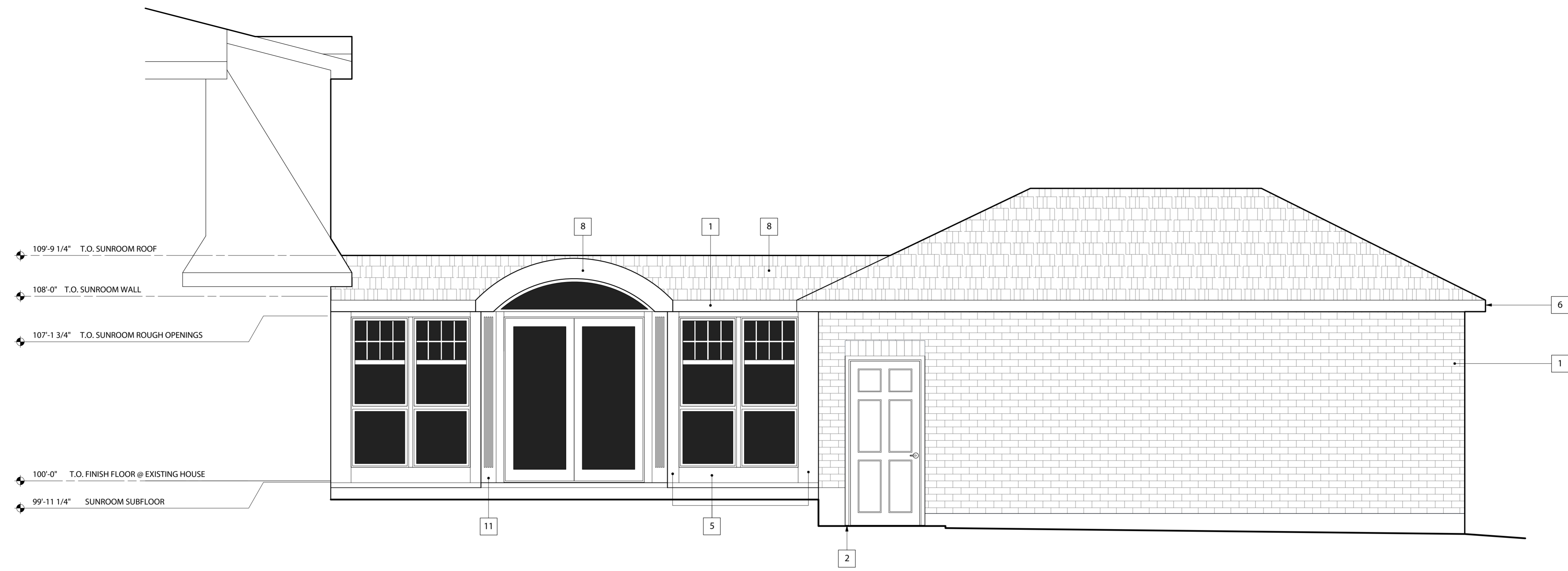
South Elevation 1 Scale: 3/8" = 1'-0"